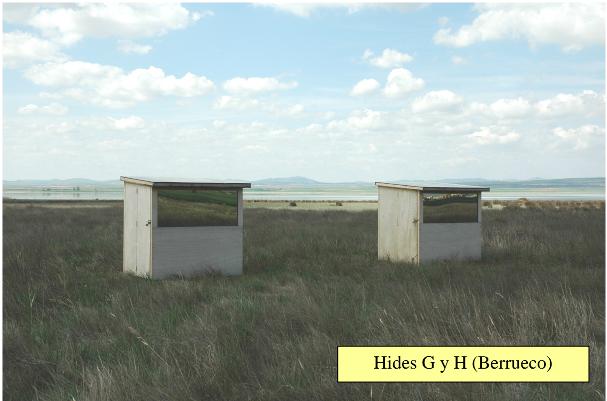
Hides G y H (Berrueco)