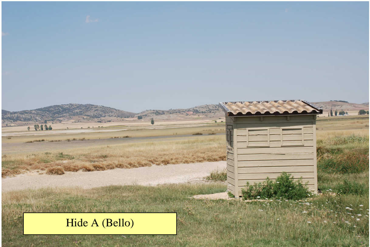
Hide A (Bello)